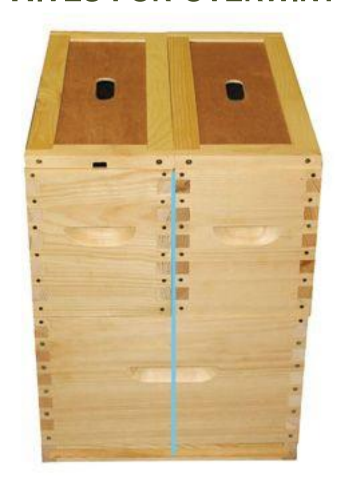
Blue line marks the shared center divider.